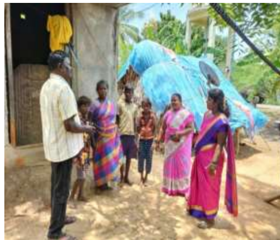
Group Motivation at Salavakkam ST Colony