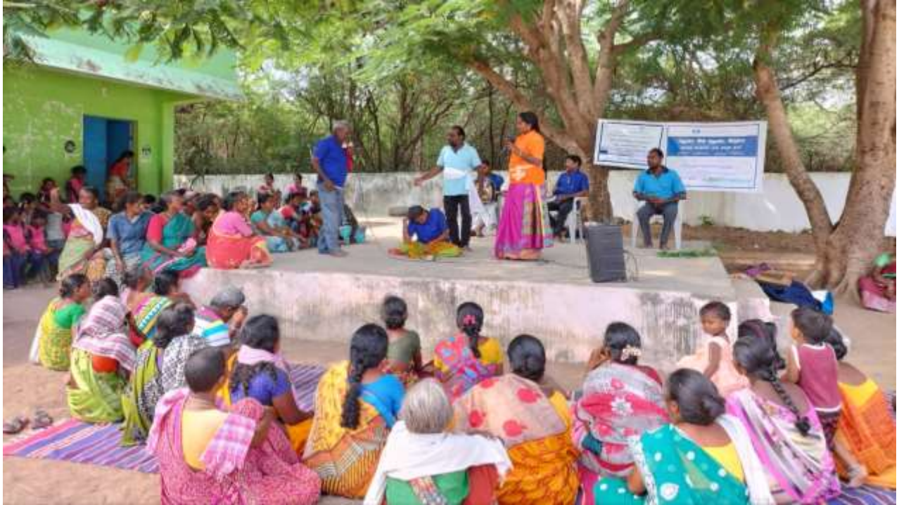
Cultural Awareness on Child Rights and Protection at Rettamangalam Panchayat