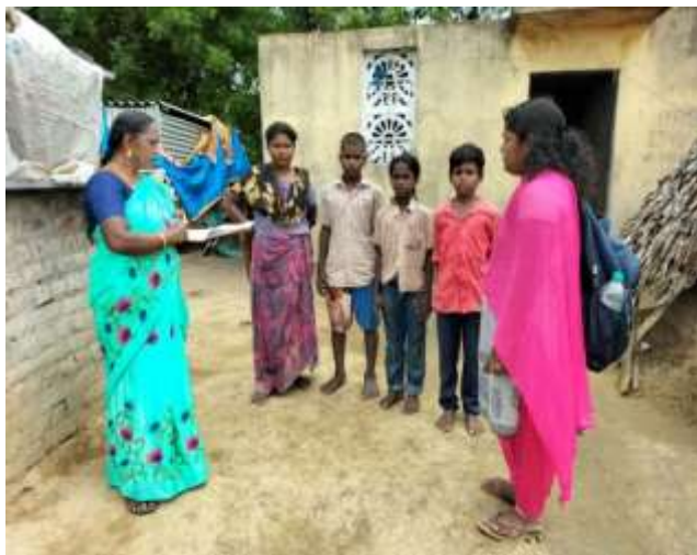
Baseline Survey at Rettamangalam Panchayat