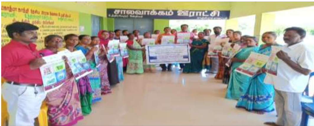
Stakeholder's meeting at Salavakkam Panchayat