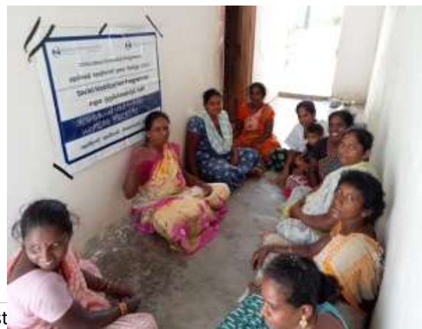
Awareness meeting among Women in Thirumukkoodal Panchayat