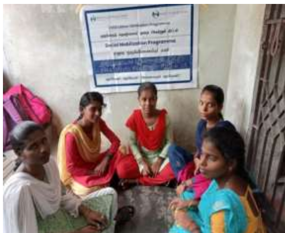
Awareness meeting among Adolescent Girls of Neyyadipakkam Panchayat