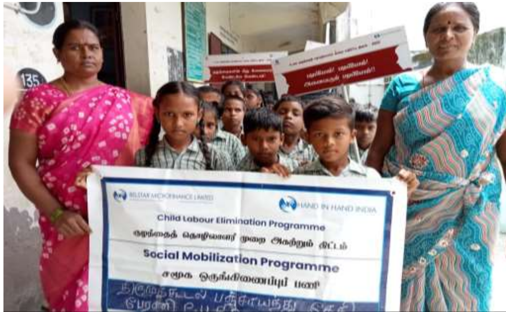
Awareness Rally to Regularize Attendance of Children in Govt schools